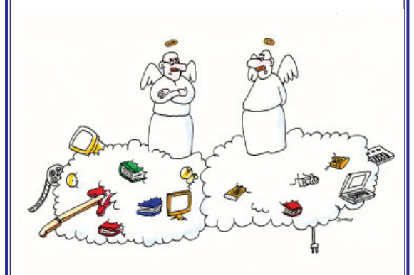
CLOUD COMPUTING "I'd prefer it if they stored their stuff someplace else!"