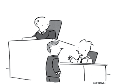
“I wouldn’t call it identity theft, I just self-identify as other people.”

By embracing a mindset of continuous improvement, recognizing the wide range of threats and understanding the collective responsibility of cyber security, your business will remain safe, resilient and thriving, no matter what the future holds.