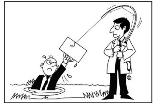
“Business Associates are on the hook for HIPAA violations.”

Breaches can be very costly for a medical organization. Penalties have ranged from $ 50,000 to $ 4.8 million. Notification costs, legal fees, and lost revenue add up fast. HIPAA has been used as a Standard of Care in malpractice suits and in 2012 a jury awarded $ 1.4 million for malpractice when a patient’s information was released without authorization.